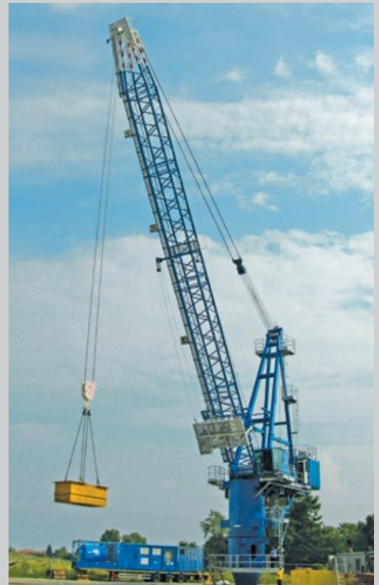
Lattice Boom Pedestal Crane Type TS 1200 E - Saipem - Castorone Pipe-Lay Vessel (-40°Celsius)