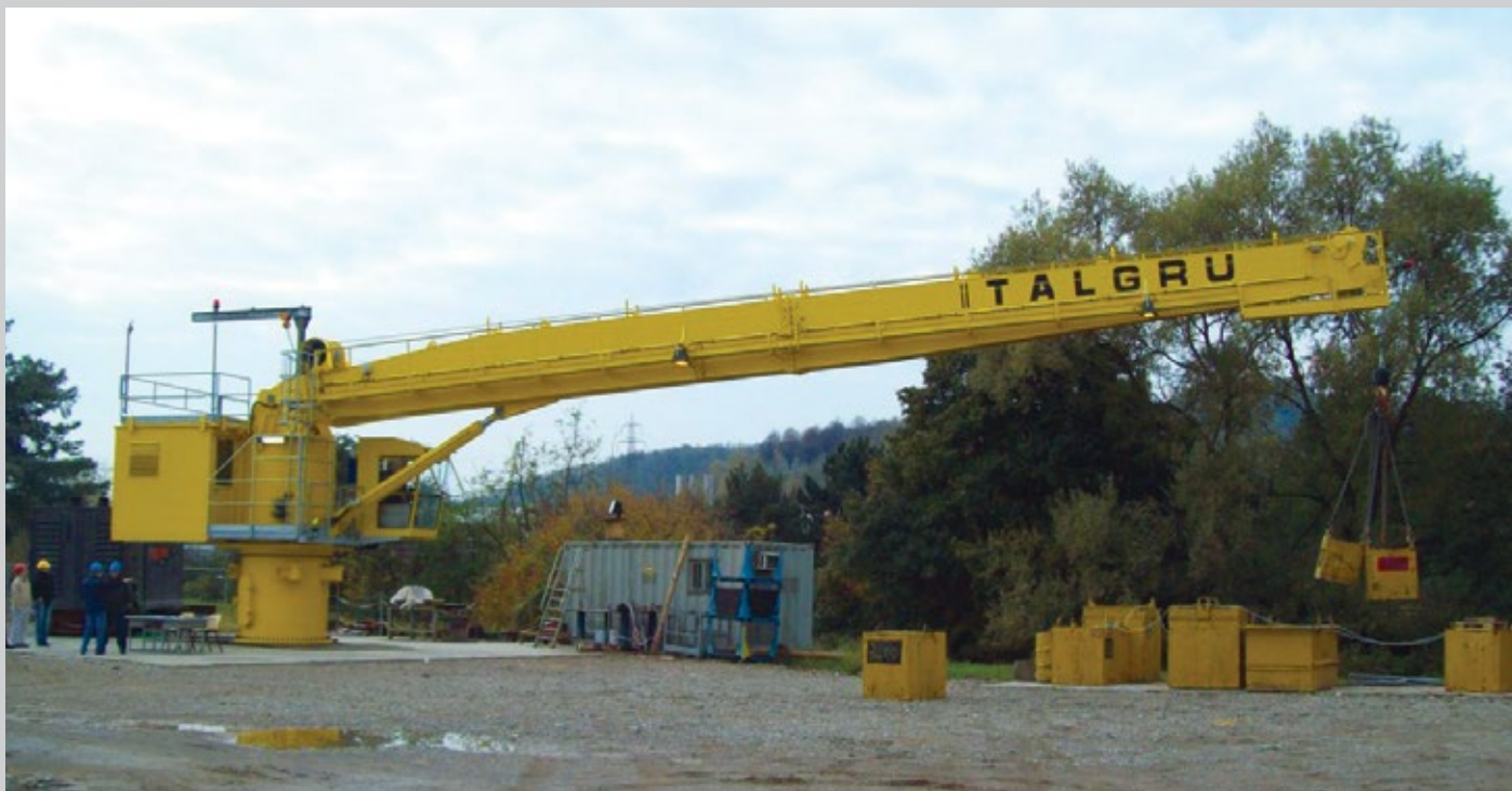
Box Boom Type Pedestal Crane TC 180 EH – Saipem – CNR – Olowi Field Platform