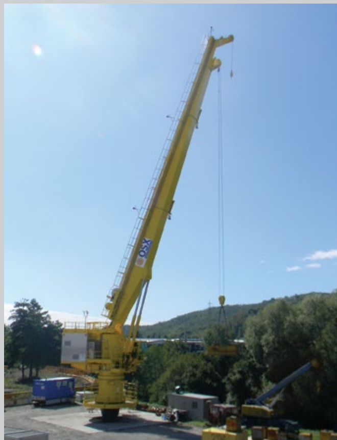
Box Boom Crane Type TC 1200 EH - SBM - FPSO OSX 2