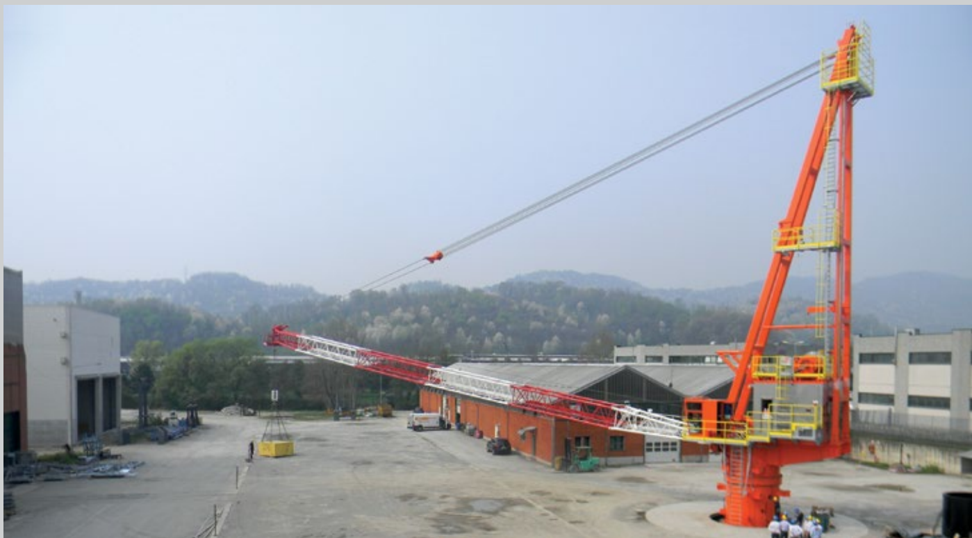
Lattice Boom Pedestal Crane TS 1800 DH – Saipem – Foster Wheeler – Icoeep Platform