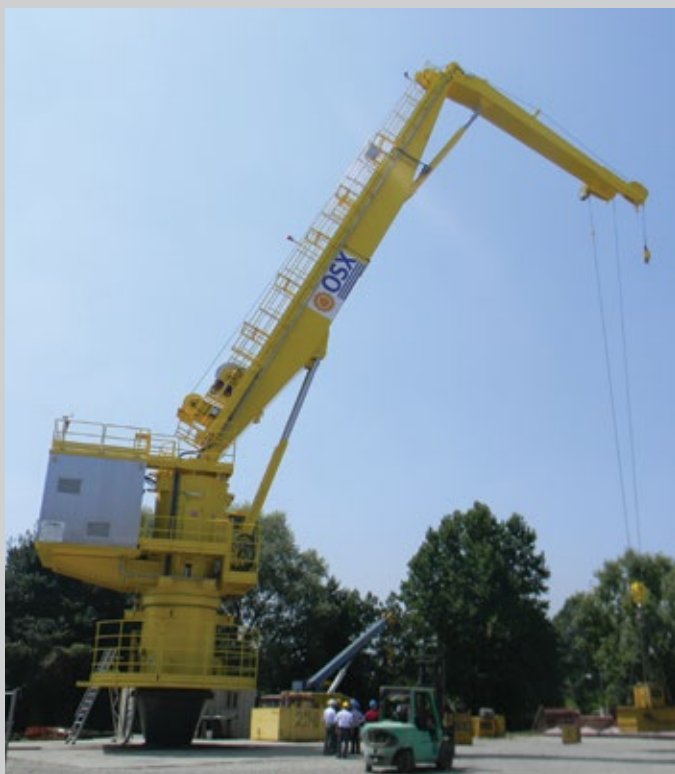
Knuckle Boom Type Pedestal Crane TK 1200 EH – SBM – OSX – FPSO OSX 2