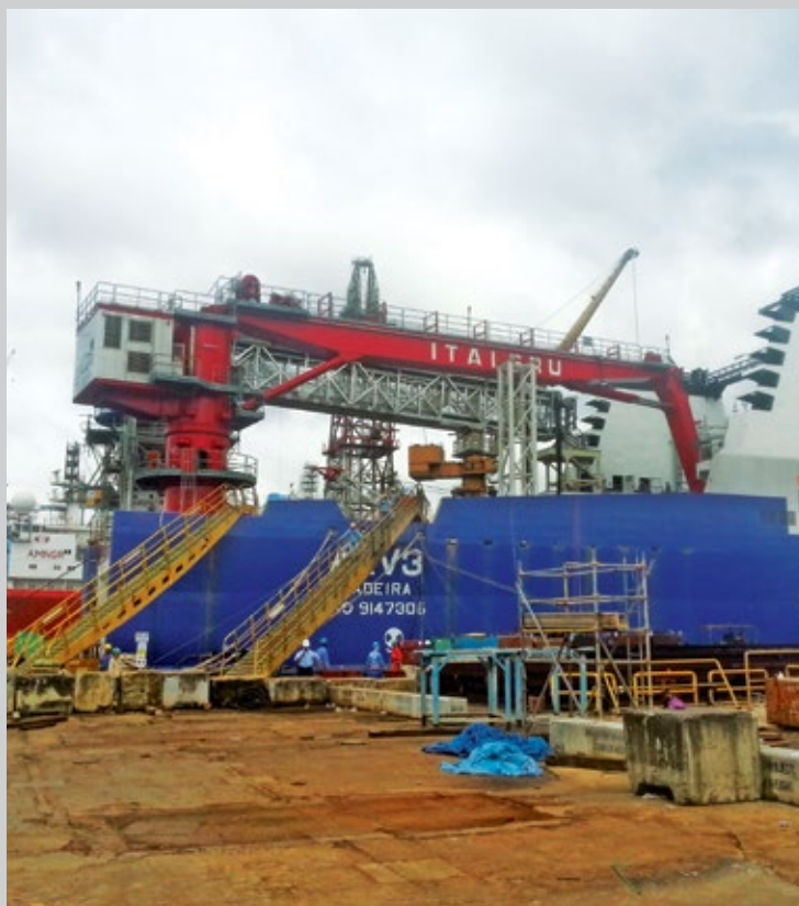
Knuckle Boom Crane Type TK 1800 EH – Poseidon Offshore – Accommodation Barge Aquarius Brazil