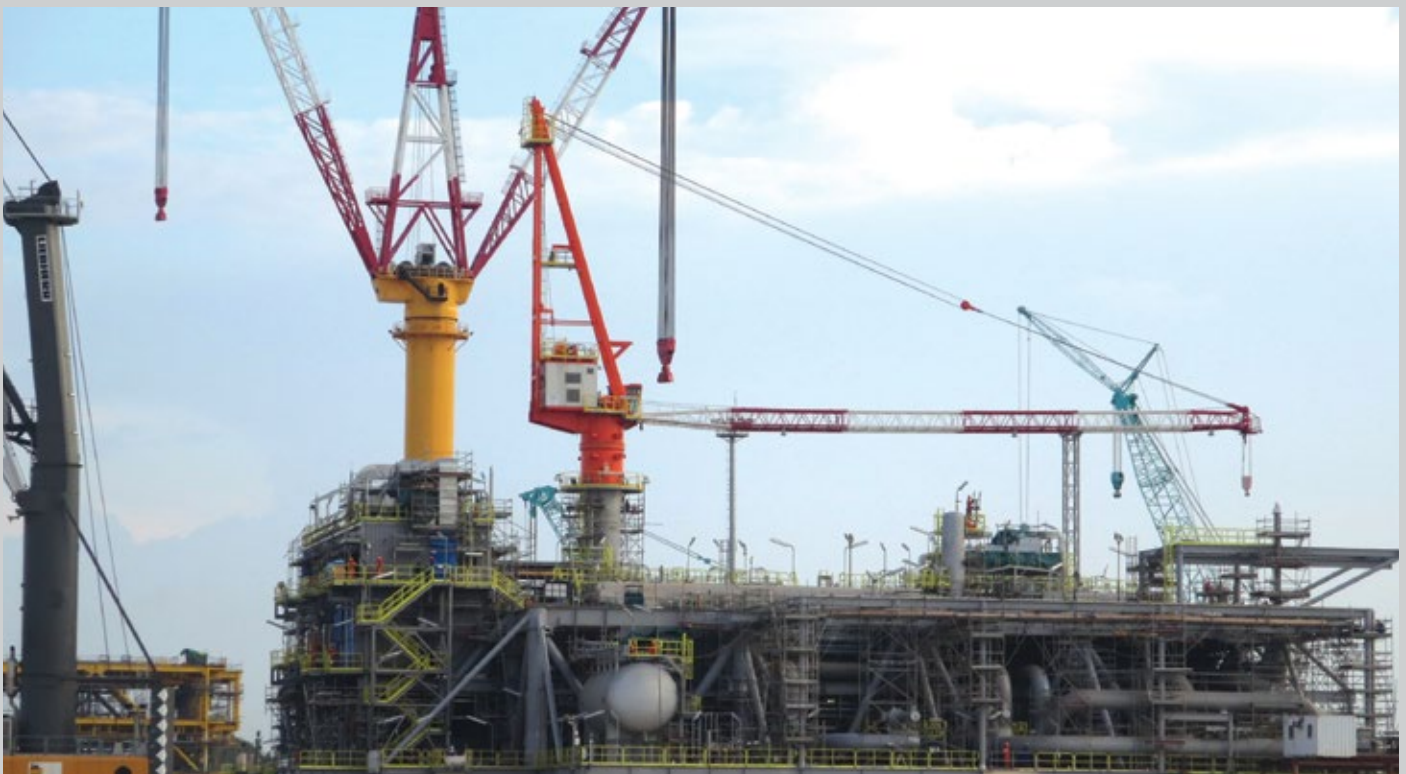
Lattice Boom Pedestal Crane TS 1800 DH – Saipem – Foster Wheeler – Icoeep Platform