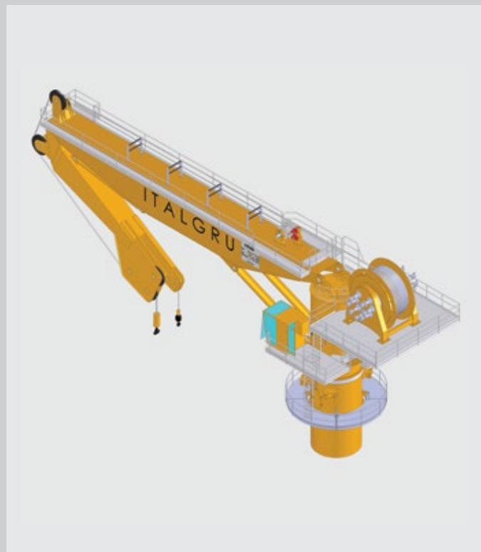
Knuckle Boom Crane Type TK 5000 EH AHC