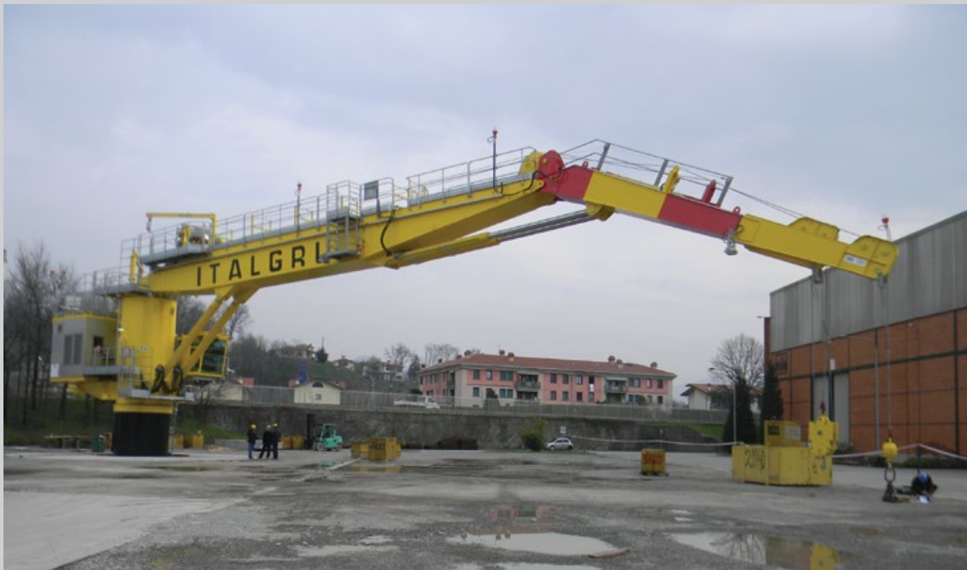
Knuckle Boom Crane Type TK 1800 DH - SBM - FPSO Cidade De Ilhabela