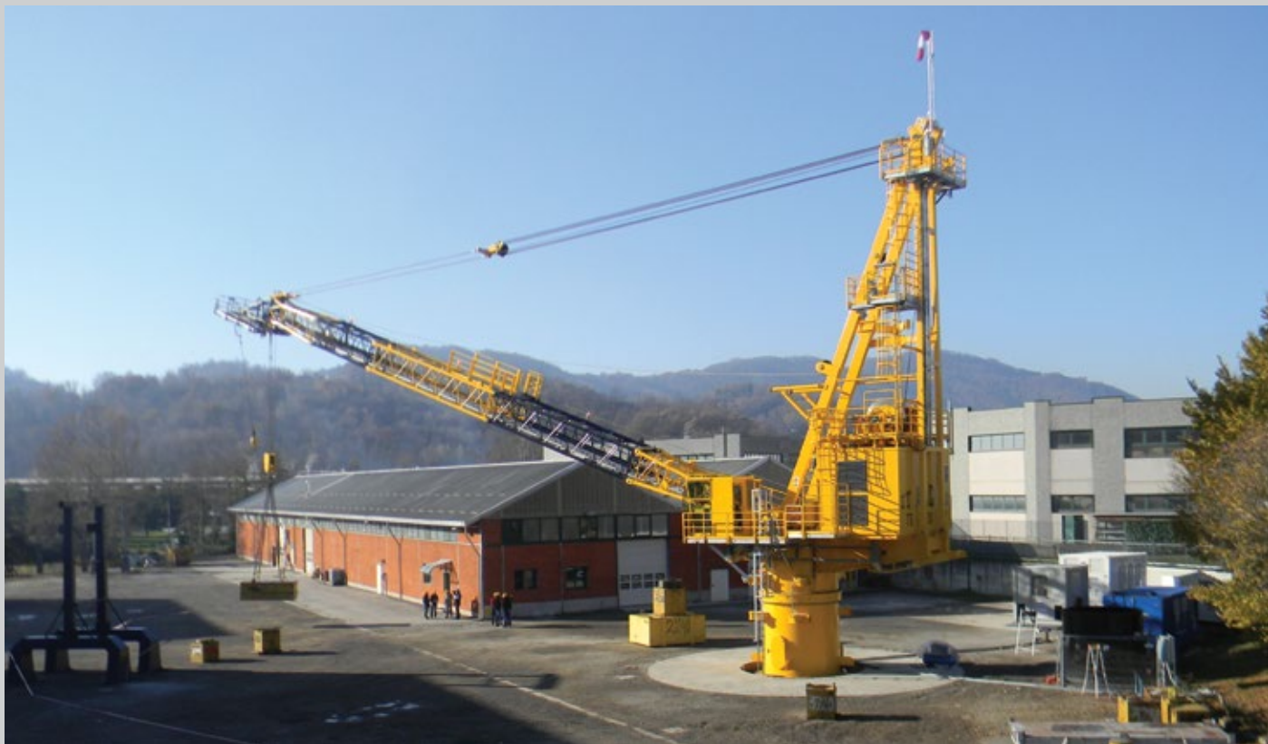
Lattice Boom Pedestal Crane type TS 1200 EH – Technip – Petronas FLNG Project