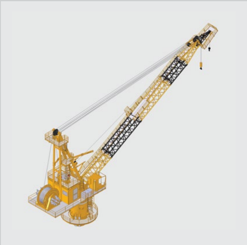
Lattice Boom Crane Type TS 5000 EH - AHC

Tel. +39 - (0) 35.49.32.411 Fax +39 - (0) 35.49.32.409 info@italgru.com / www.italgru.com