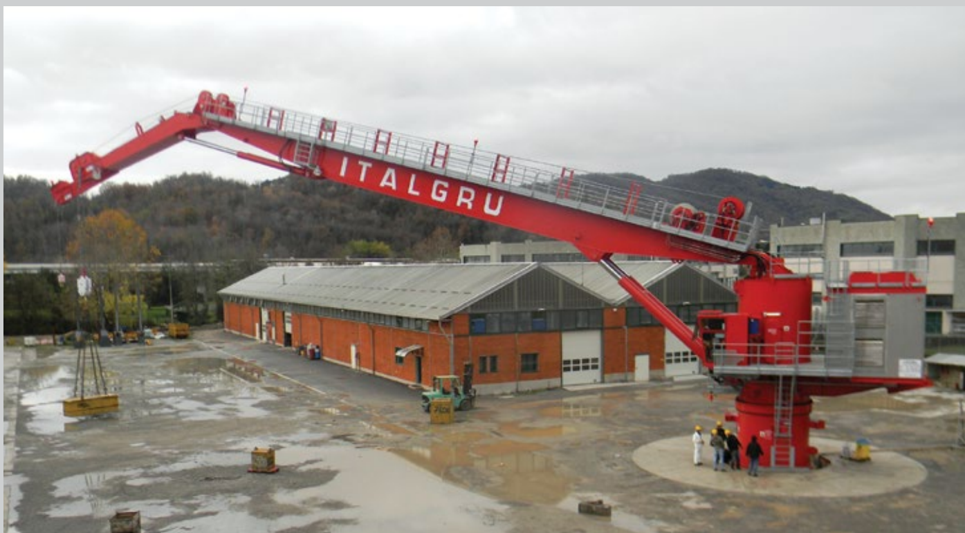
Knuckle Boom Type Pedestal Crane TK 1800 EH – Poseidon Offshore – Petrobras – Accommodation Barge Aquarius Brazil