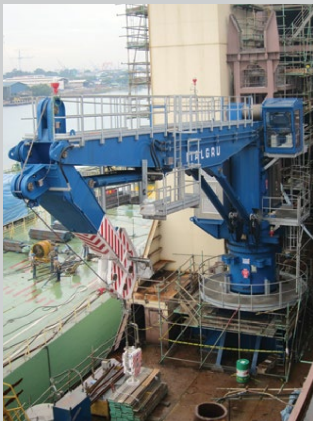
Knuckle Boom Crane Type TK 820 EH – Saipem – Castorone Pipe-Lay Vessel (- 40 Celsius)